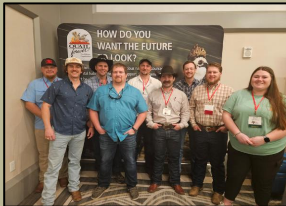
TX PFQF biologists at the 2023 TX Ch. of The Wildlife Society meeting in Houston (Feb '23)

When it comes to habitat delivery, the last 3 months have been productive to say the least! Our team members conducted >130 site visits (including >60,000 acres of ‘new’ property) and helped plan >40,000 acres of conservation practices. To top it all off, our team was able to be a part 10 Rx burns, totaling 5,511 ac (8 of those burns [accounting for 1,226 ac] would NOT have occurred without our QF involvement)! See page 6 for more great impact metrics.